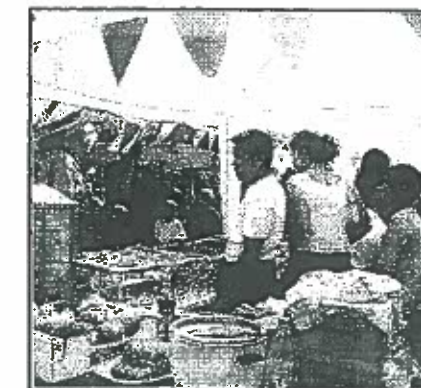
5 Pinoys in Bryggens Virkelighed 10