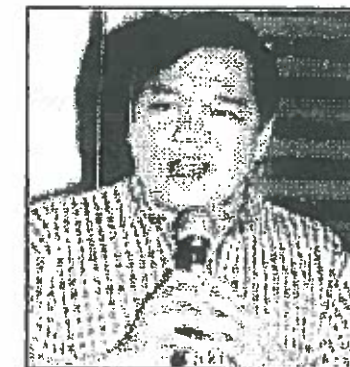
18 Gov. Lina of the Calabarzon