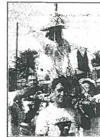
22 Roasted Pigs Festival