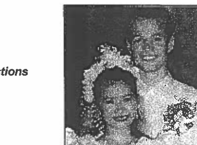
12 I married a Filipina