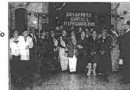
10 BCFM Arsfest & Julefrokost 2001

Community News Bayanihan Arsfest 5 & Julefrokost 2001 Damayan holds lottery 2001