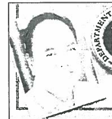
DFA Minister Blas Ople