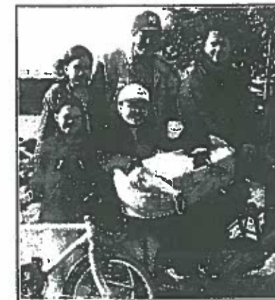
BCFM Family Picnic