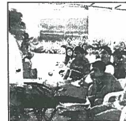
Absentee Voting for the OFWs