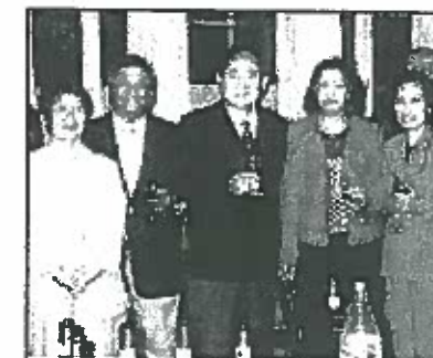
De Venecia visits Copenhagen