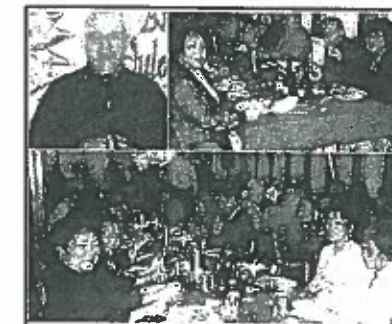
BCFM Arsfest & Julefrokost 2003

30 CHRISTMAS MESSAGES/GREETINGS ADVERTISEMENTS